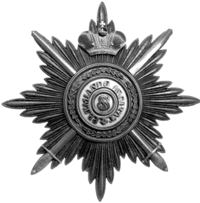
242 Order of St. Stanislaus , Military Division, breast star, in silver, with gilt and enamel centre, gilt swords and gilt reverse, by Keibel, late 19 th century, 93 mm., fitted with later, unofficial Imperial crown, extremely fine £600-800